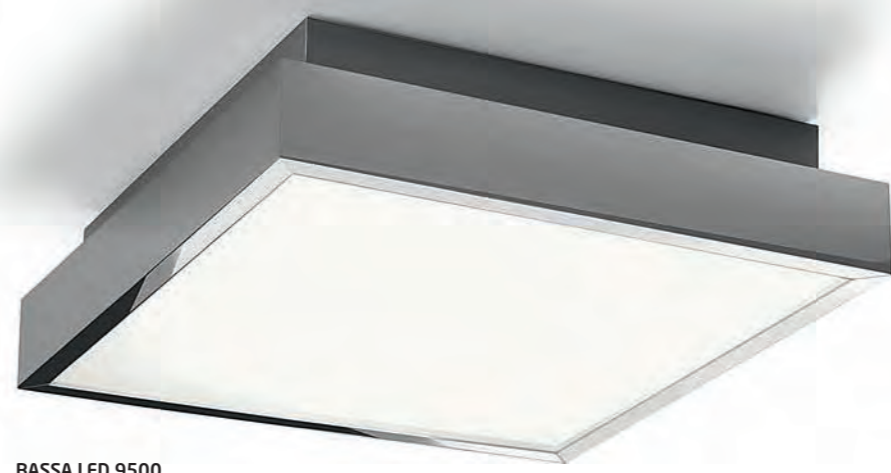
BASSA LED 9500