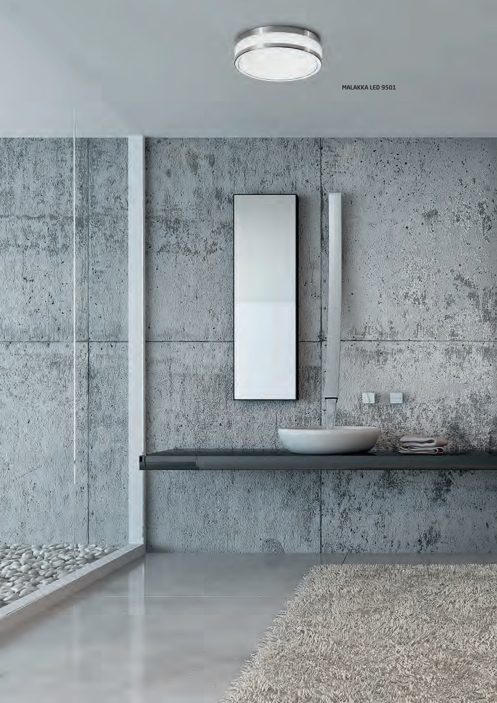
MALAKKA LED 9501